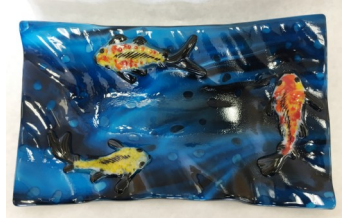
Platter with Koi castings