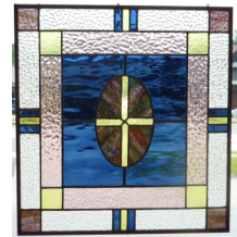
COPPER FOIL PROJECT