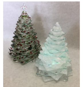
3 D Christmas Tree