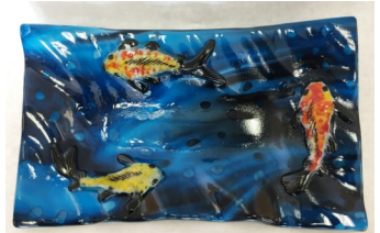
PLATTER WITH KOI CASTINGS