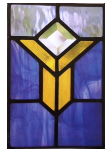
Lead Came Project