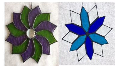
Copper Foil Projects

Students will learn glass cutting basics and the copper foil method of stained glass construction. Students must purchase their own glass cutter, breaker pliers, soldering iron. Fee includes materials. Pam Gentry Instructor